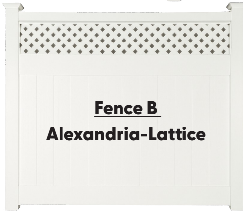
Fence B Alexandria-Lattice