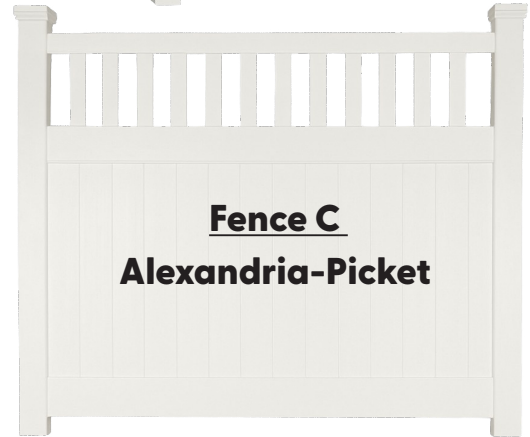
Fence C Alexandria-Picket